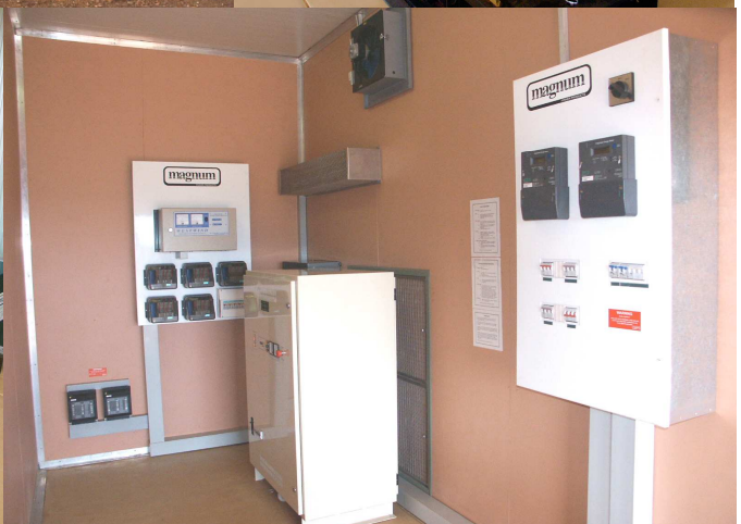
Top: Areal shot of the station and power complex. Middle Left: The solar array and wind turbine. Middle Right: Automatic backup generator. Bottom Left: Deep cycle battery bank in ventilated room. Bottom Right: Instrument/power.